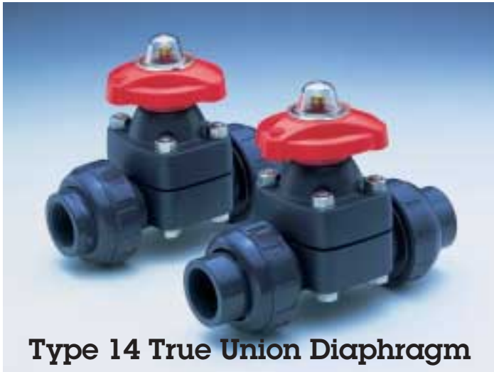
Type 14 True Union Diaphragm