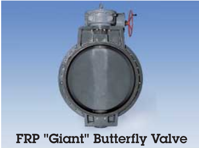
FRP "Giant" Butterfly Valve